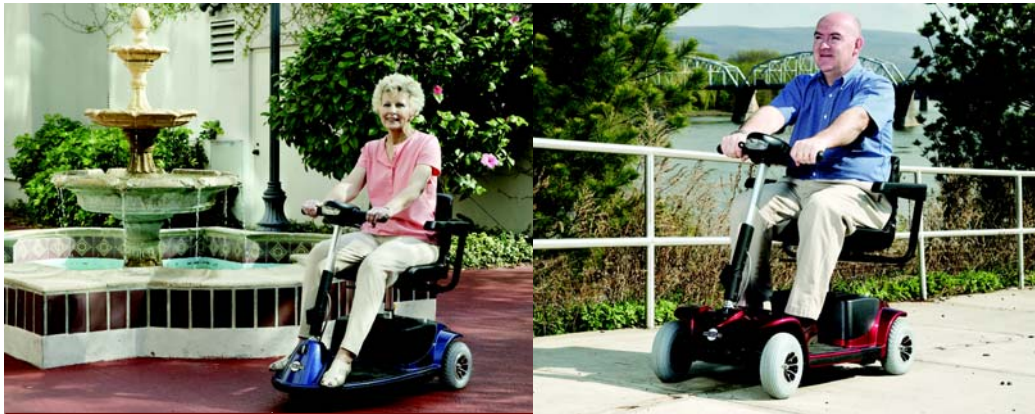
Revo ® 3-wheel