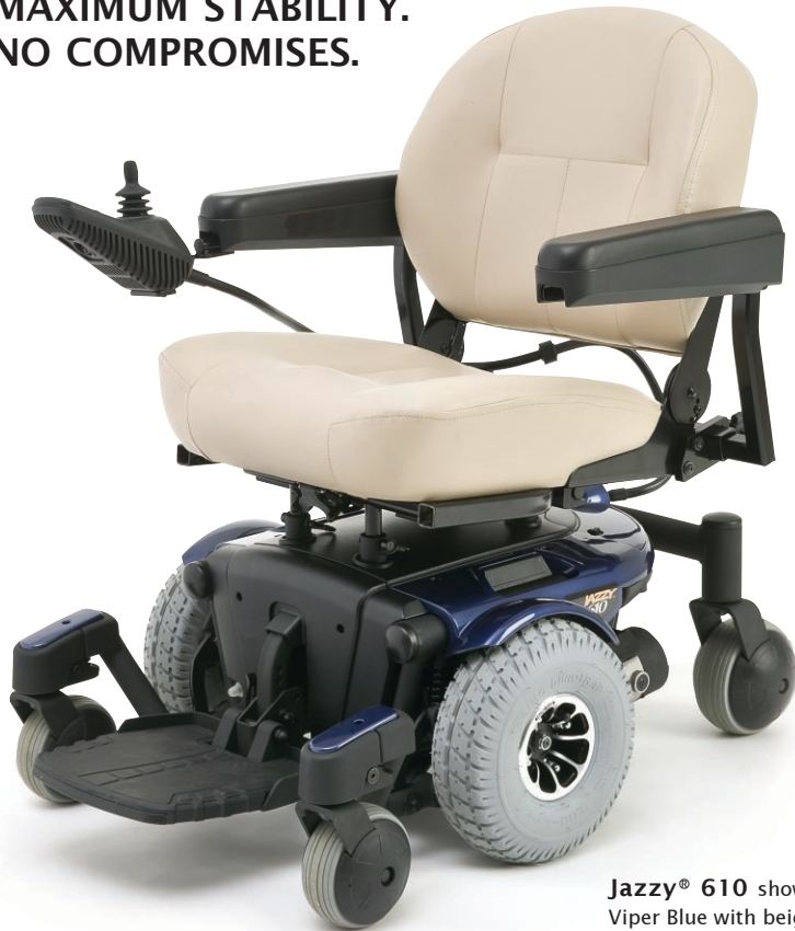
Jazzy® 610 shown in Viper Blue with beige contoured medium-back seat, foot platform and PG VSI controller.

TRUE ALL-AROUND PERFORMANCE. MAXIMUM STABILITY. NO COMPROMISES.